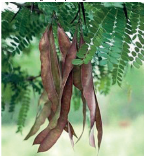
Figure 1. Gleditsia triacanthos L. The spines are long, hard, simple and branched with dark brown spines (Fig. 1).

Gleditsia triacanthos L. It is a broad crowned tree reaching 40 (45) m high. The trunk branch-