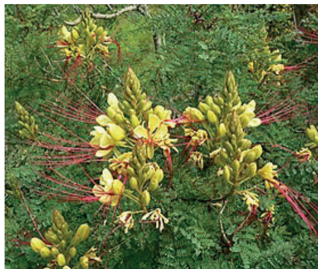
Figure 6. Erythrostemon gilliesii (Hook.) Klotz.

The genus includes about 40 species. There are 2 species of the genus in Azerbaijan: Caesalpinia gilliesii (Wall. ex Hook.) D. Dietr. and C. japonica Sieb. et Zucc.