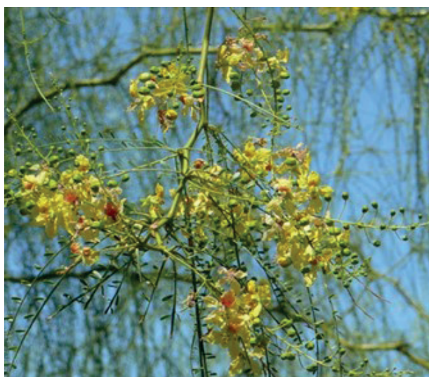
Figure 4. Parkinsonia aculeata L.

a beautiful appearance. Male trees are often grown for decorative purposes in parks and city streets (Fig.3).