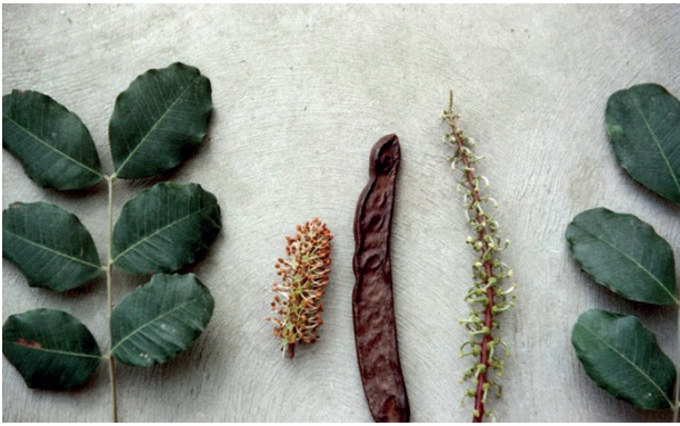
Figure 5. Ceratonia siliqua L.

ancient Rome, seeds were used as a measure of weight in the weighing system, which was equivalent to about 0.19 g - one carat. In ancient times, the mass of precious stones was measured by the seed of the plant. It got its name from the bread tree of Iona because its dried beans smell like yeast.