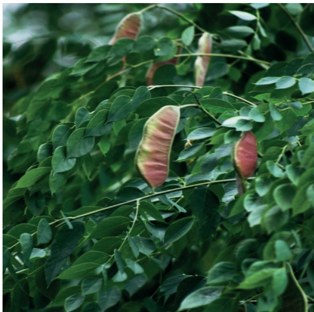
Figure 3. Gymnocladus dioicus (L.) K.Koch

Genus: 3. Gymnocladus Lam. - There are 5 species distributed in North America, East and Southeast Asia. In Azerbaijan, 1 species - Gymnocladus dioicus (L.) K. Koch is found as an ornamental plant in greenery in Absheron, Zagatala and Lankaran. It has a straight stem up to 25 meters high, leaves are double hairy, dark green, flowers are unisex, dioecious, petals 5, yellowish-green, sepals 5 parts, stamens 10, pods broad-oblong, thick and fleshy. It is a conifer and ornamental tree with delicate leaves and fragrant flowers. Its homeland is North America. In America, the beech tree is called the coffee tree because in the past its roasted seeds were used as a cheap substitute for coffee. It is used as an ornamental plant due to its double hairy large leaves that give the plants