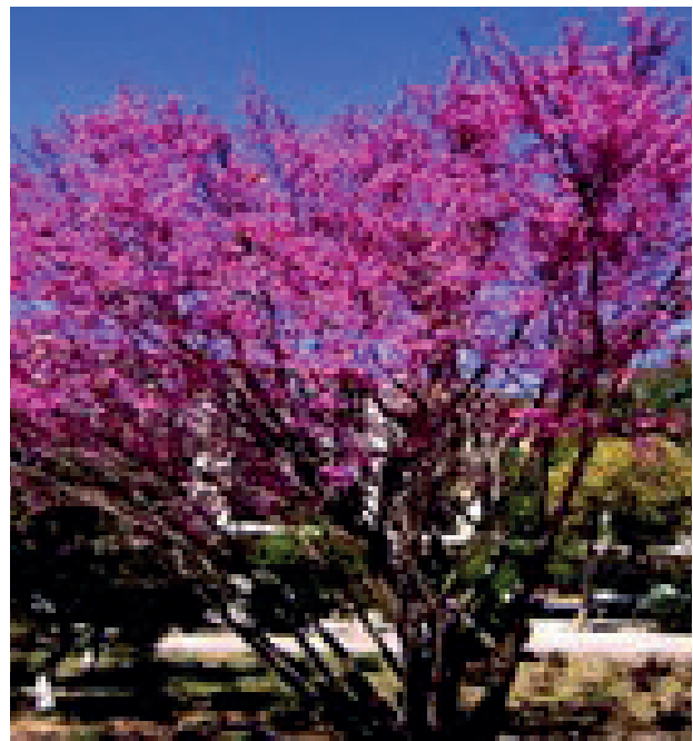
Figure 2. Cercis siliquastrum L.

Seeds 4-5 mm long, 3.5-4 mm wide, flat, oblong-ovate, dark brown, smooth. It blooms in april-may before the leaves are formed, the fruits ripen in september-october and remain